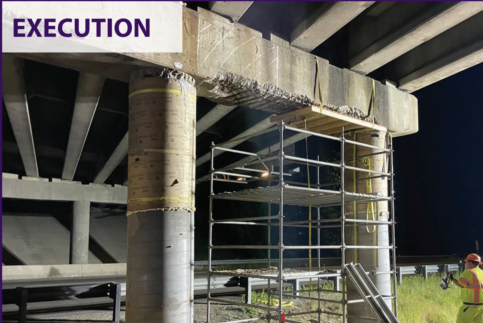
Full-time experts without the full-time price tag.