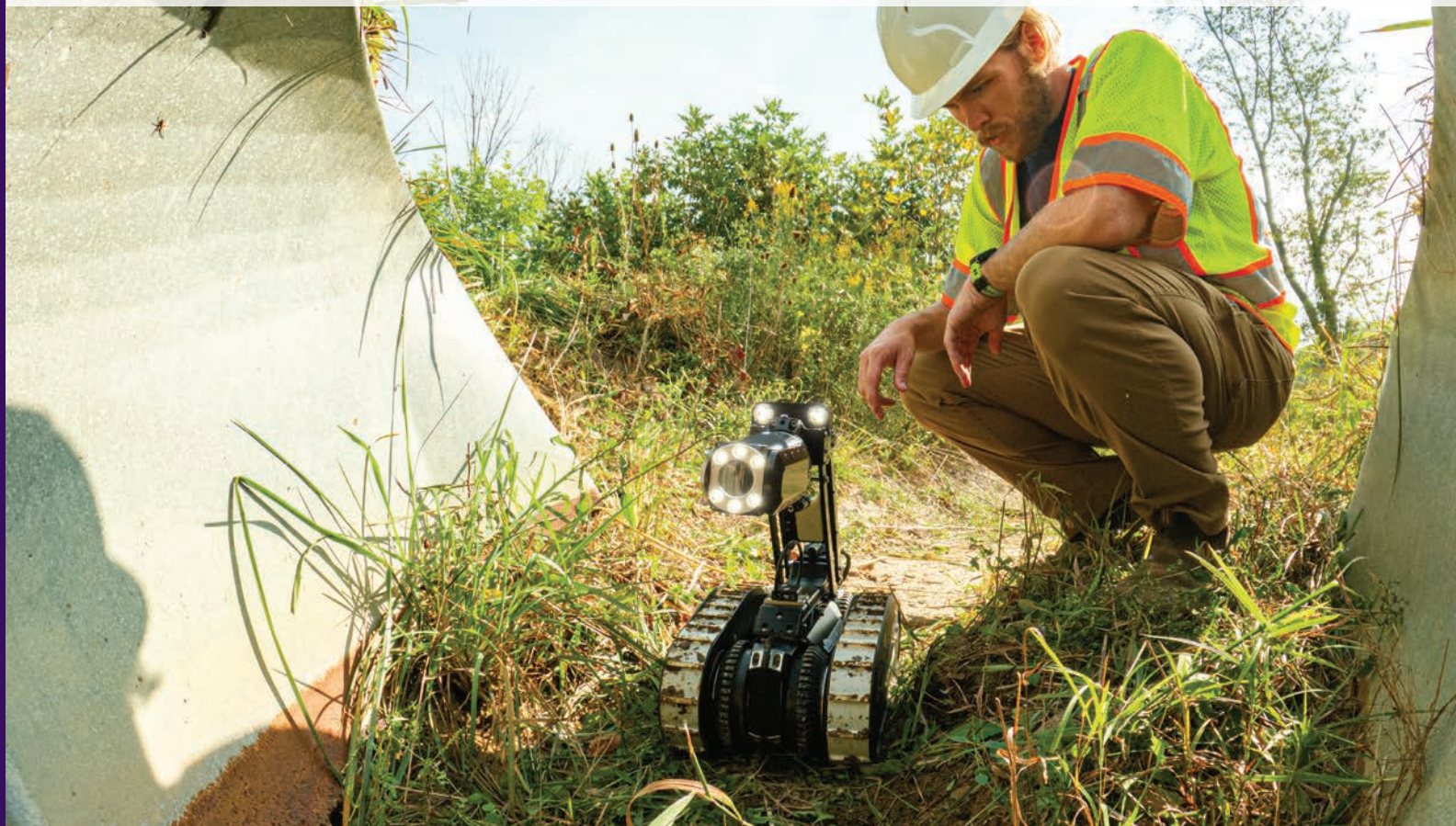
Speed through asset collection with PILLAR.