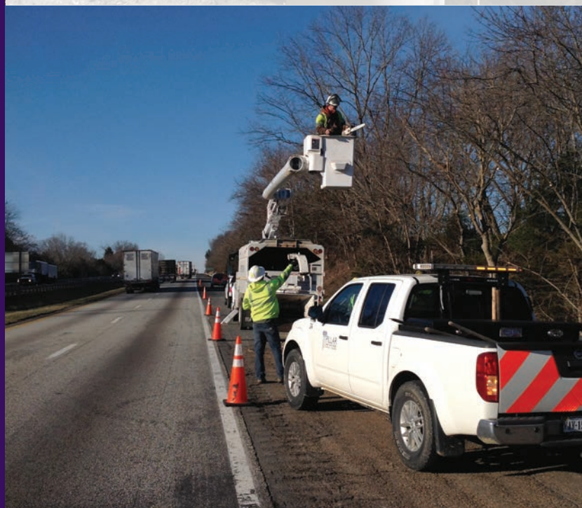
Seamlessly manage contracts and quality control.