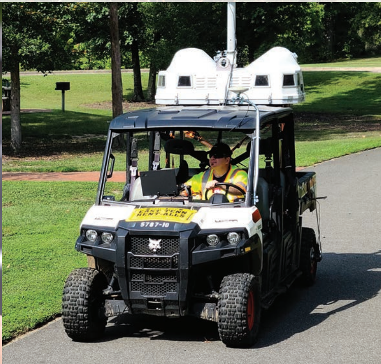
Maximize the lifecycles of your assets with PILLAR.

Take your asset management program from reactive to proactive with PILLAR.