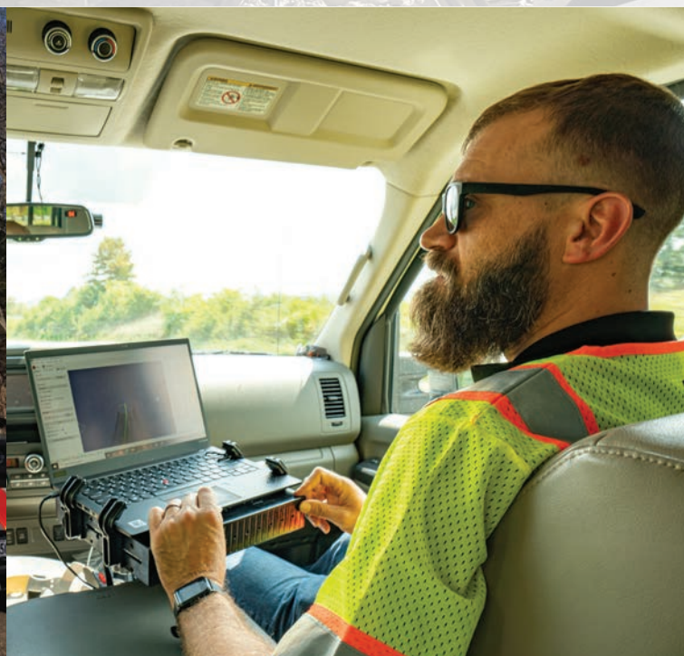
Boost your knowledge base with staff augmentation services.

Overworked and understaffed? Not with PILLAR on your side. Contact us to add experienced professionals when and where you need it most.